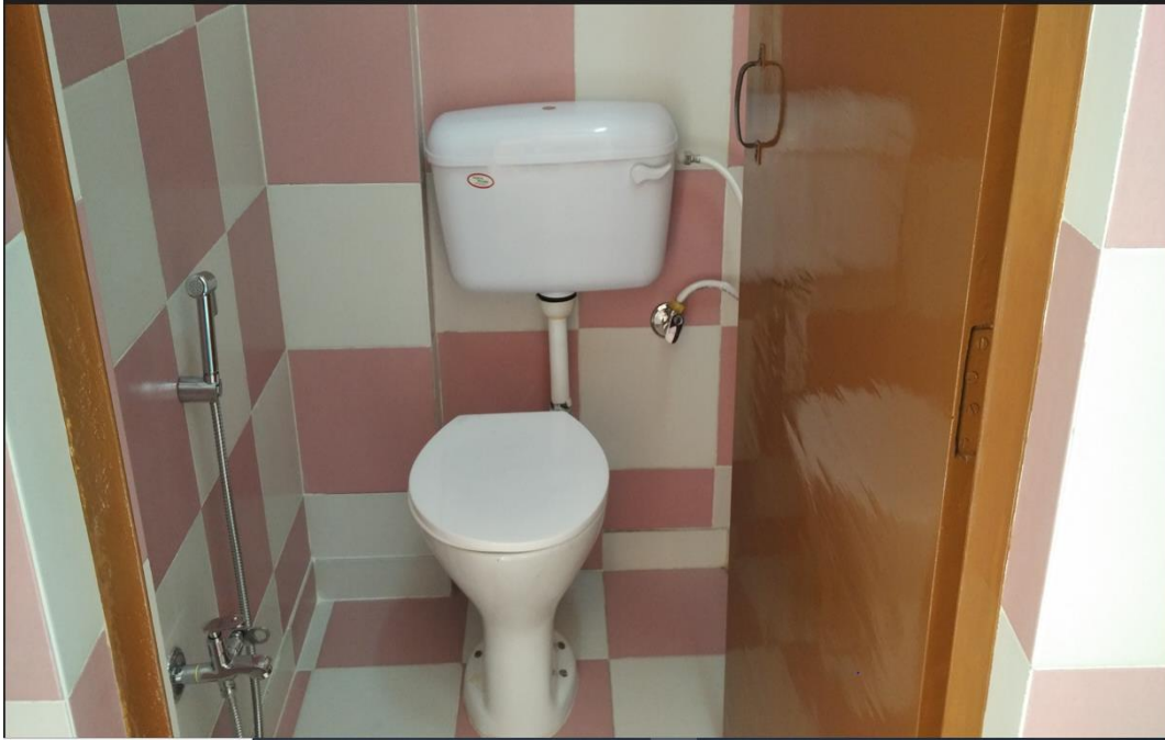
After the upgrade