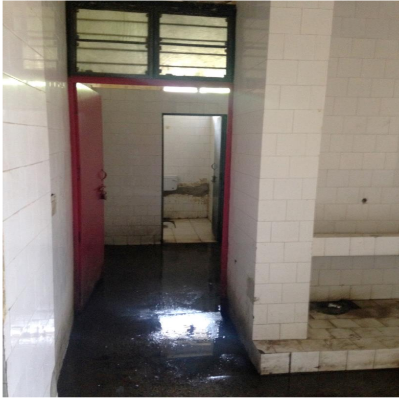
Before the upgrade