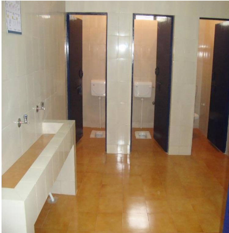
After the upgrade