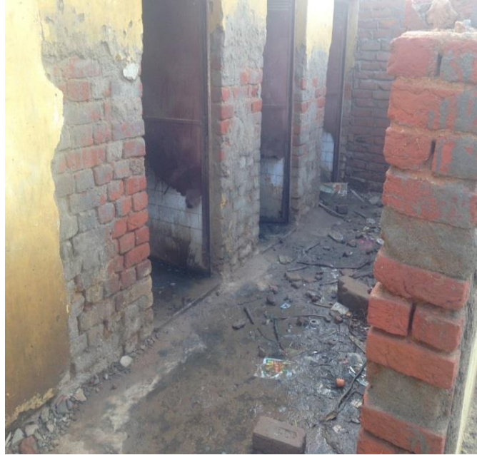
Before the upgrade