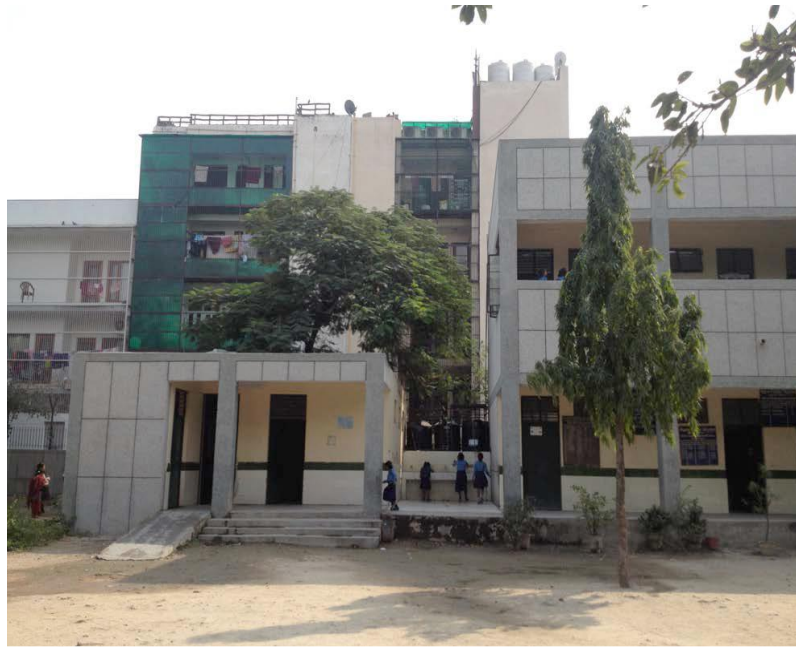
Before the upgrade