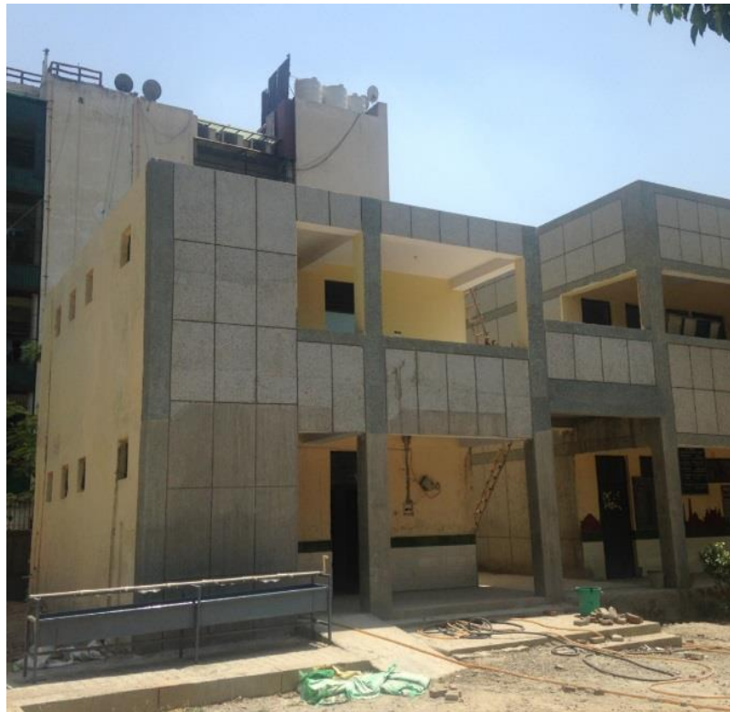
After the upgrade