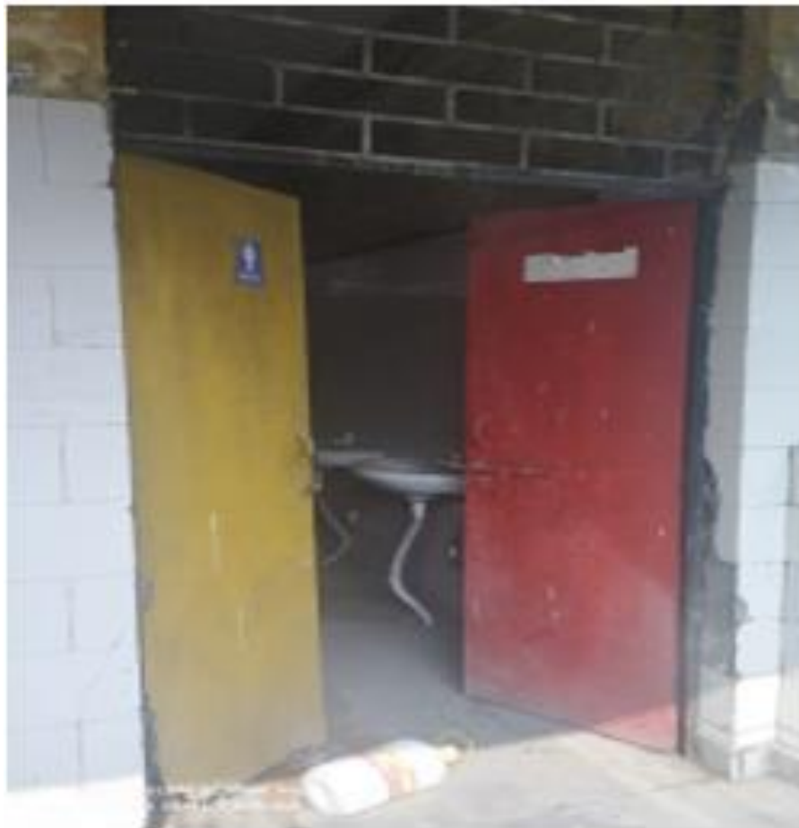
Before the upgrade