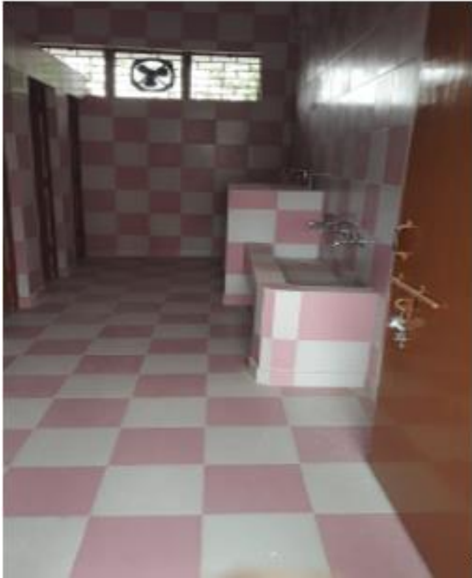
After the upgrade