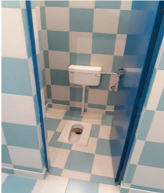
After the upgrade