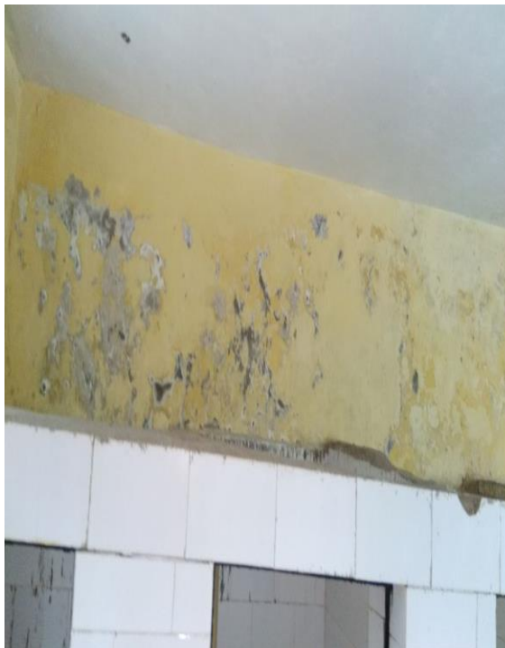
Before the upgrade