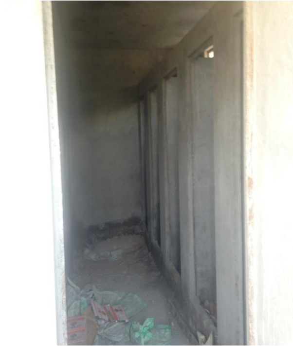
Before the upgrade