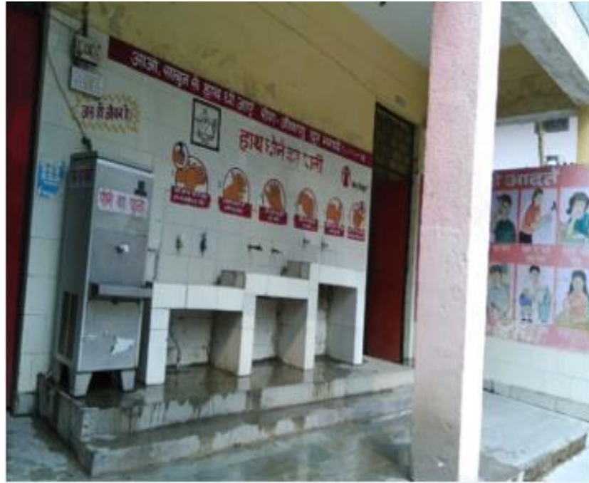
Before the upgrade