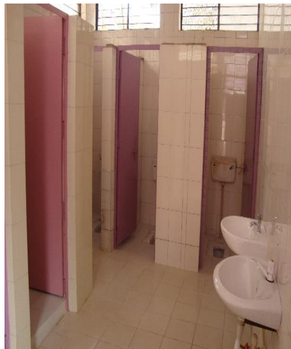
After the upgrade